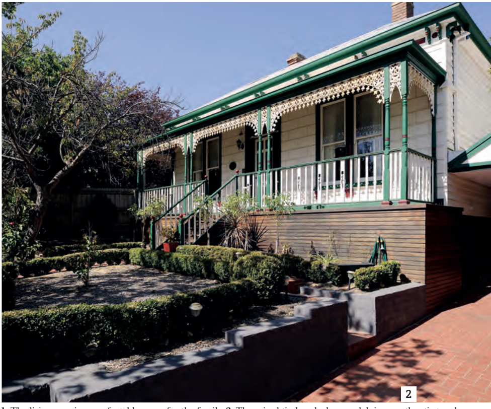
1. The living area is a comfortable space for the family. 2. The raised timber deck verandah is an authentic touch.